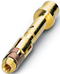
Crimp contact, turned, Single contact, contact diameter: 1 mm, crimp range: 0.06 mm 2 ... 0.25 mm 2

Please be informed that the data shown in this PDF Document is generated from our Online Catalog. Please find the complete data in the user's documentation. Our General Terms of Use for Downloads are valid ( http://phoenixcontact.com/download )